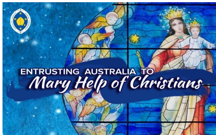
Artwork: Mary Help of Christians